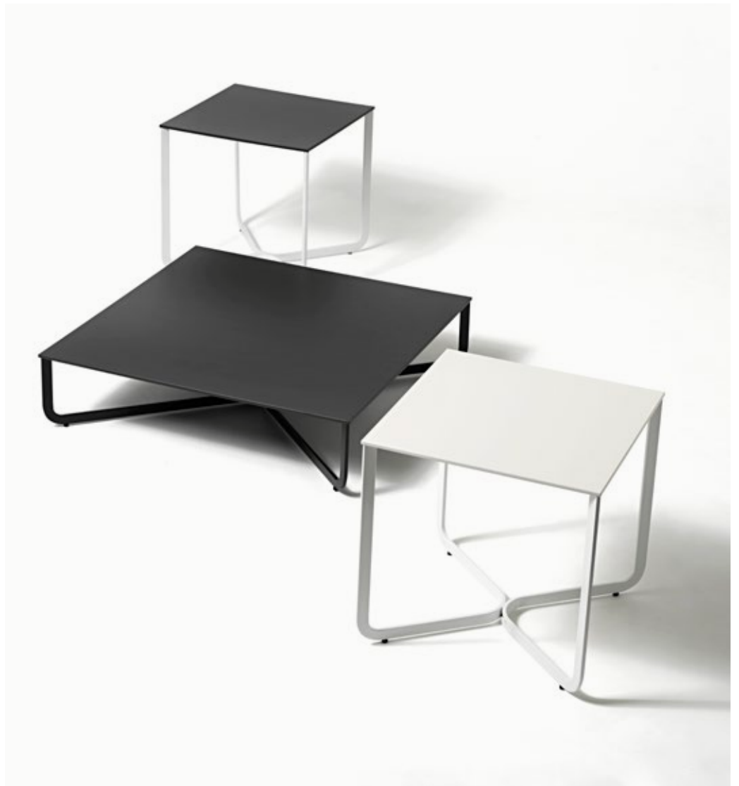
Black / White

A simple and minimalist item resting on a metal blade for a highly stylized look. The cross-base inspires the name and creates unique design, with recognisable dimensions, low in the XS version and high in XL.